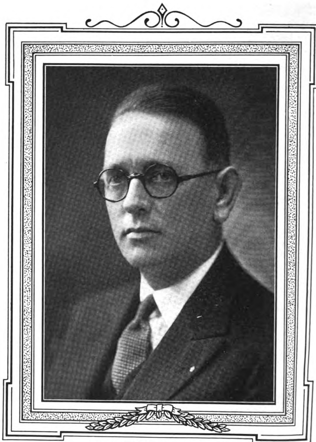
HON. FRANK D. FITZGERALD Governor of Michigan